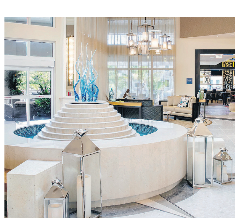
Playa Largo Resort & Spa made it through the hurricane season without significant structural damage.

The range starts with deluxe, spacious hotel rooms and suites, decked out in Florida-fresh decor of whites and blues, and fully loaded with fancy toiletries by Bulgari and new glass showers. Moving up in privacy and posh factor, head for The Hammocks. This is a secluded